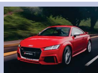
Motor vehicles: $65,000