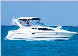
Marine vessels: $100,000