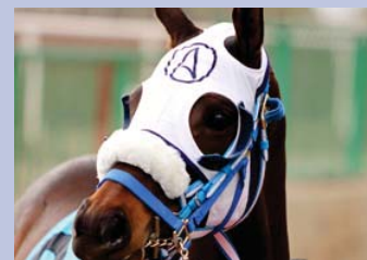
Thoroughbred horses: $65,000