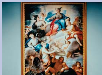
Fine art (per item): $100,000